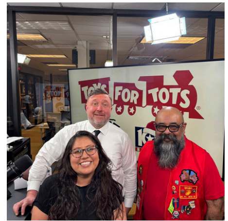
Heart of Texas Marine Corps League 975