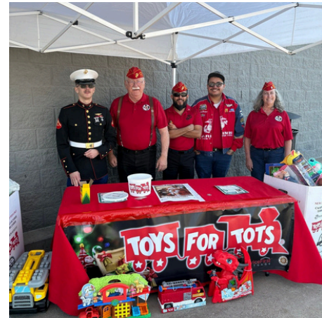
Longhorn Detachment 1069, Marine Corps League