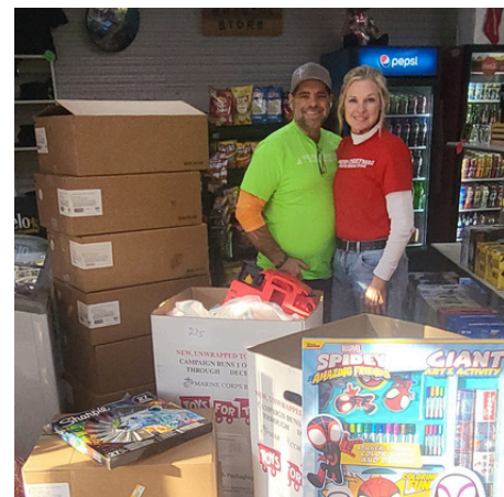
Ellis Co Det Marine Corps League #1452