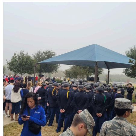
Alamo Detachment 315 ~ Marine Corps League

This past December, as part of Wreaths Across America, several detachments took the time to honor our fallen heroes by placing wreaths at their final resting places. Through your dedication and selfless service, the memories of those who served our nation continue to live on.