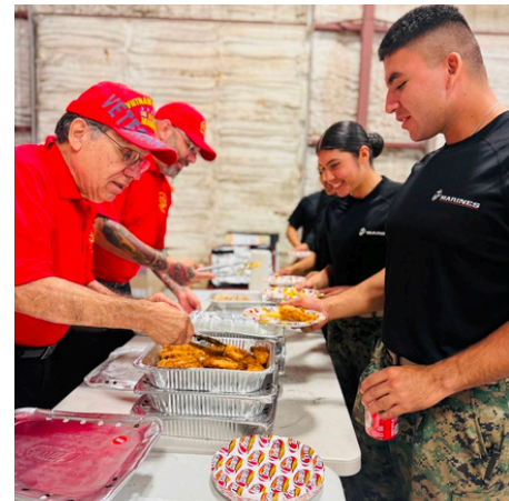
Alamo Detachment 315 ~ Marine Corps League