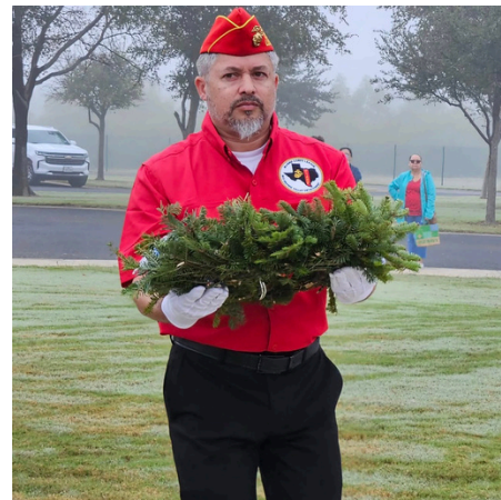
Rio Grande Valley Detachment #1456