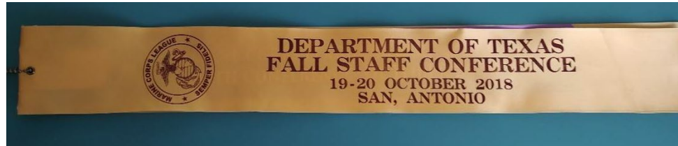
Dept Of Tx Fall Conference Streamer. See Section 5.7.d for details.